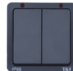
IP66 10A 1 Gang Doorbell Weatherproof Switch with LED indicator.