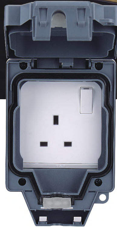
IP66 1 Gang Socket Enclosure + T&J brand 86mm Socket

IP66 socket enclosures are compatible with 86mm height T&J wall plates.